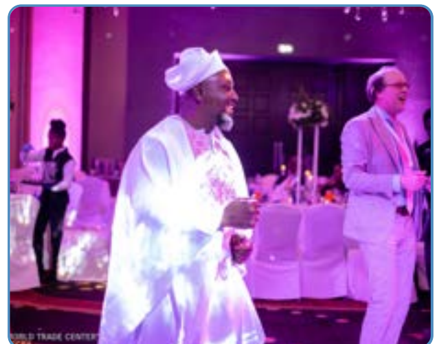
(Top) WTCA Members and staff at the 2023 WTCA GA, held in Accra, Ghana from April 23-27.