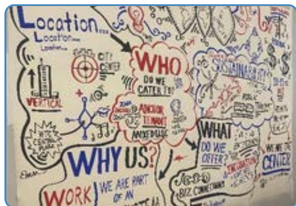
(Left Top and Bottom) Attendees at the 2023 WTCA NA Regional Meeting, held on October 17 in New York City. (Right) Design based on the interactive charette: "Building the Ideal WTC Business."