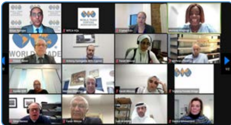
Screenshot of attendees at the 2023 WTCA MEA Regional Meeting held virtually December 6.

The MEA Regional Advisory Council (RAC) will formally launch in 2024.