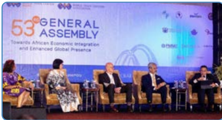
During the 2023 WTCA General Assembly, MAC Chairs held a panel discussion, providing updates on their projects.

In October 2023, the WTCA Board of Directors voted to sunset the AgMAC in order to focus resources to the Association's pillars; Convention & Exhibitions, Real Estate, Business Clubs, and Trade Services.