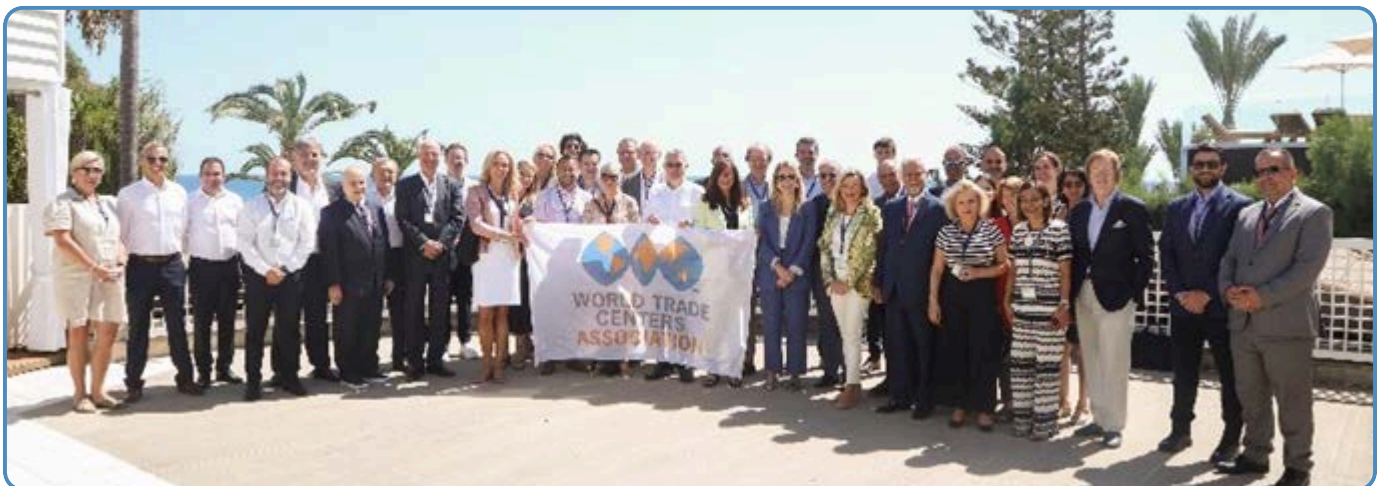
Group photo of attendees at the second semester 2023 WTCA European Regional Meeting, hosted by WTC Cyprus from September 13-15 in Limassol, Cyprus.