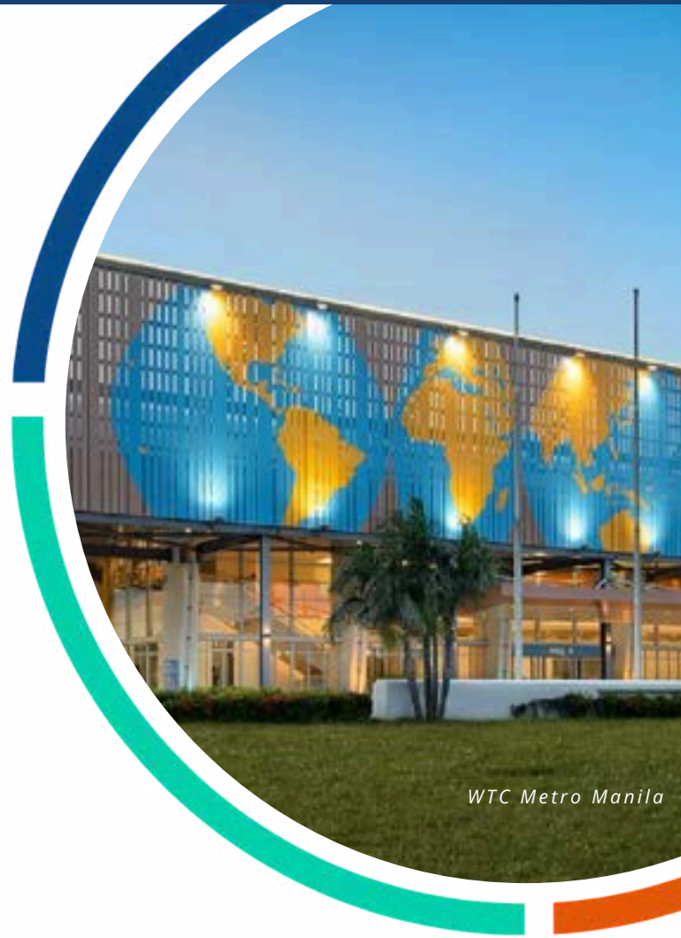
WTC Metro Manila