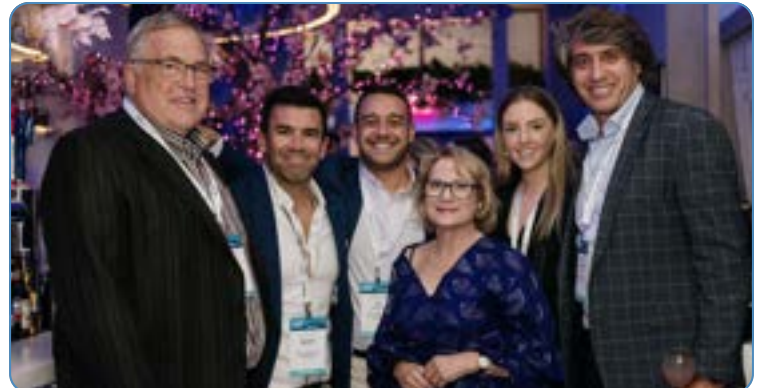
Members at the 2023 WTCA General Assembly and 2023 WTCA Member Forum.