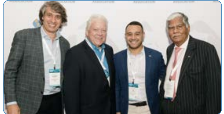
WTCA Board Directors at the Association's events throughout 2023.