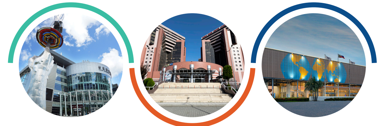
Operating WTC Taipei