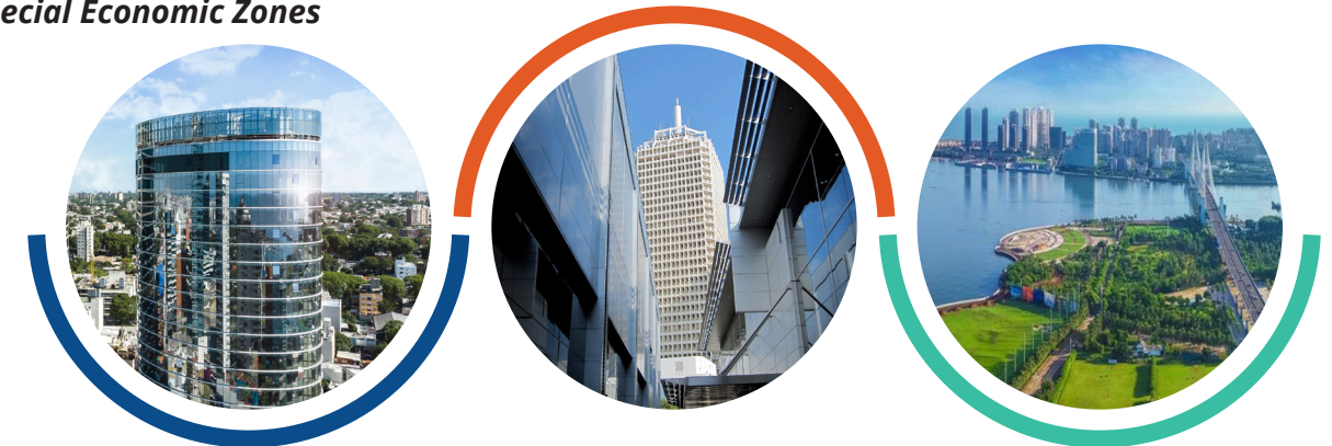
Operating WTC Montevideo