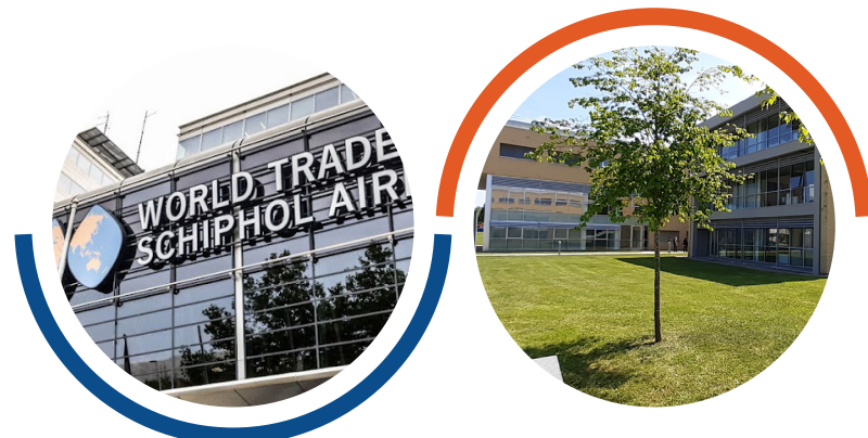
Operating WTC Schiphol Airport