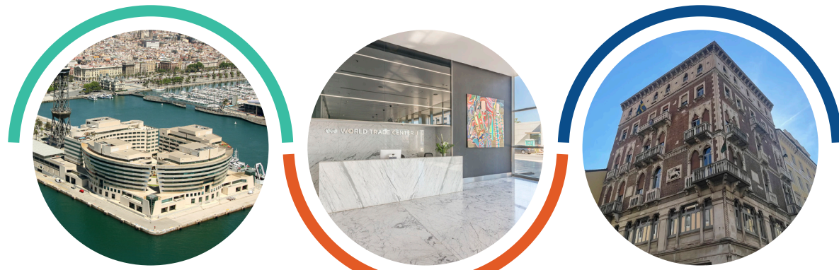
Operating WTC Barcelona