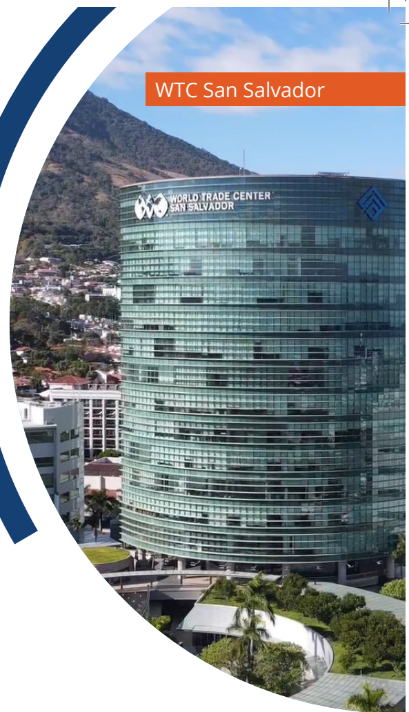
WTC San Salvador

Join us on this journey, where each connection is a step toward a more prosperous, peaceful, and collaborative world. Together, we are not just shaping the future of trade; we're shaping the future of humanity.