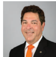
SCOTT CENTER WTC Savannah