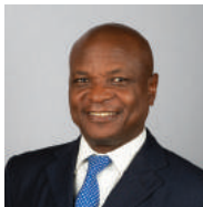
TOGBE AFEDE XIV WTC Accra